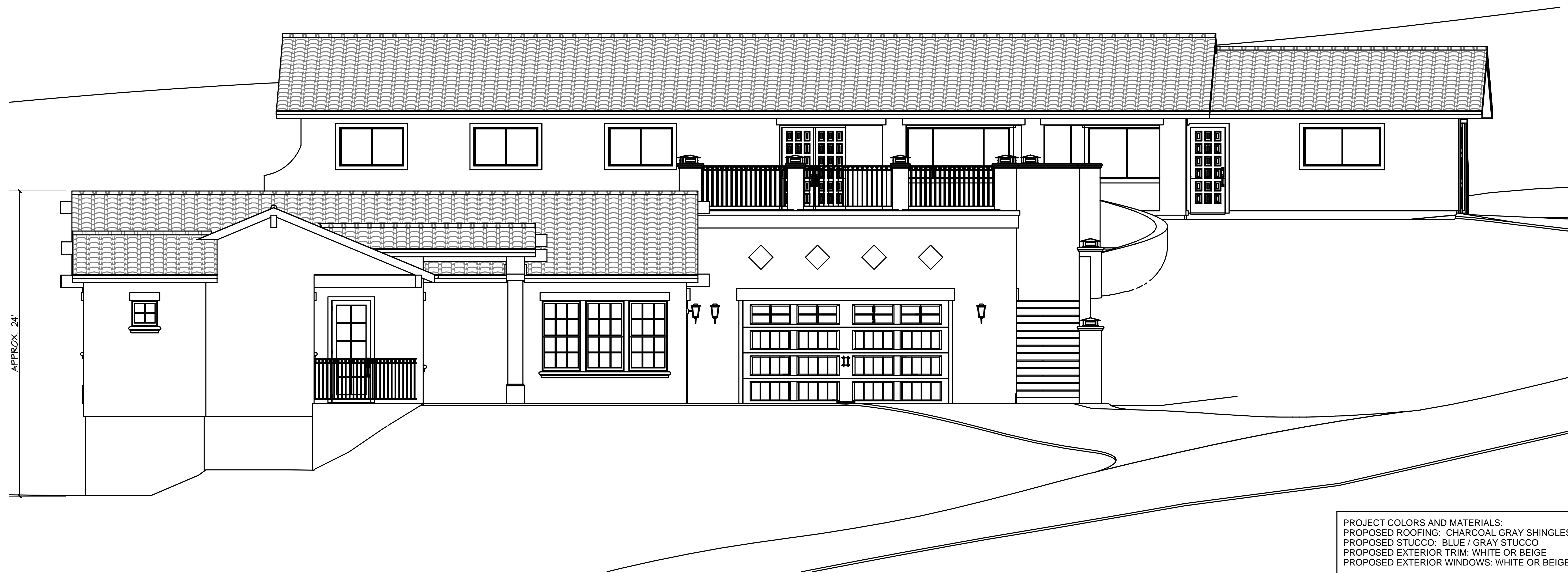
PROPOSED 2nd DWELLING UNIT WEST ELEVATION SCALE: 1/4" = 1'-0"

PROJECT COLORS AND MATERIALS: PROPOSED ROOFING: CHARCOAL GRAY SHINGLES PROPOSED STUCCO: BLUE / GRAY STUCCO PROPOSED EXTERIOR TRIM: WHITE OR BEIGE PROPOSED EXTERIOR WINDOWS: WHITE OR BEIGE NOTE THAT 2ND DWELLING UNIT COLORS SHALL HARMONIZE AND BLEND WITH EXISTING MAIN HOUSE MATERIALS AND COLORS.